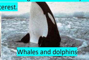
Whales and dolphins