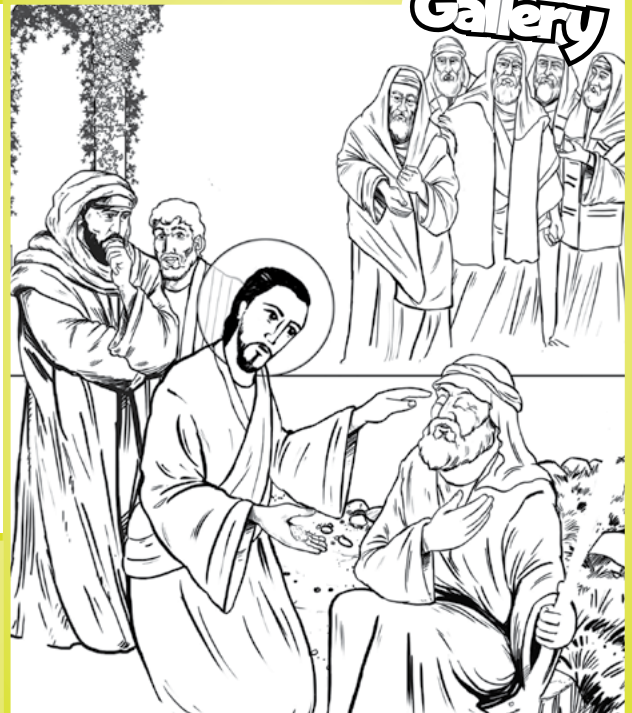
Search for at least three differences between this picture and the colour one. Then draw them in before colouring.

Cross out the letters u s t in the jumbled words below to find 4 real words.