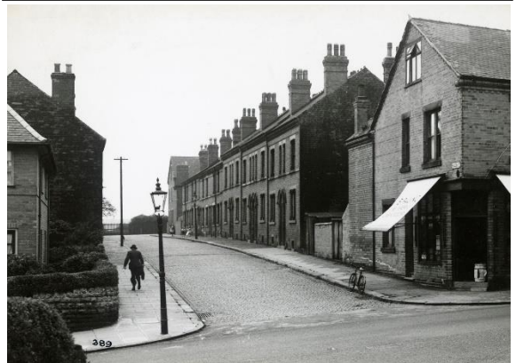
1951 Hudson Street, Gordon Road, St Ann's.

The children will be discussing how Nottingham has changed in recent history, such as the photo of Hudson street below.