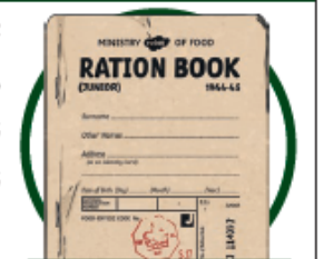
A ration book

Supply ships were targeted by German bombers and it was necessary to conserve as much food as possible. Rationing meant that each person was only allowed a fixed amount of foods. Ration books were issued, with coupons that showed people how much of each item they were allowed. Shopkeepers would remove or stamp the coupons when they were used. People were also encouraged to 'Dig for Victory' and grow as much of their own food as possible.