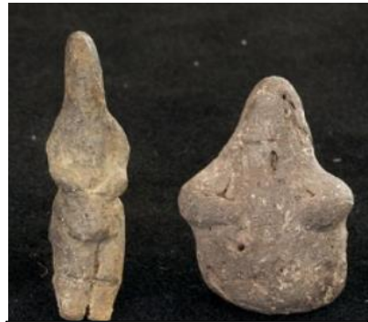
Stone-age toy figures

The children will be able to name toys from throughout history: