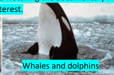
Whales and dolphins